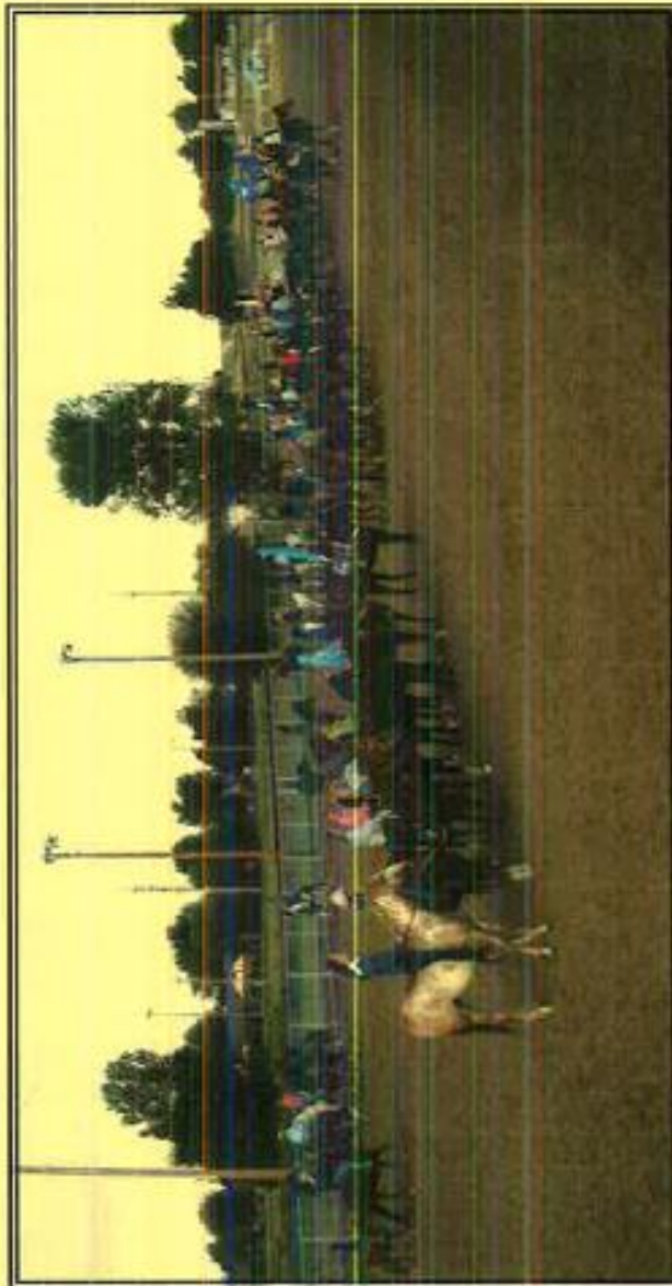
GRAND ENTRY AT THE 2011 KWHH STATE SHOW IN WAKEENEY

The Horseman's Herald 404 Morgan Ave Downs, Ks 67437