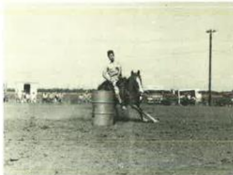
Dave Burden, Belle Plaine