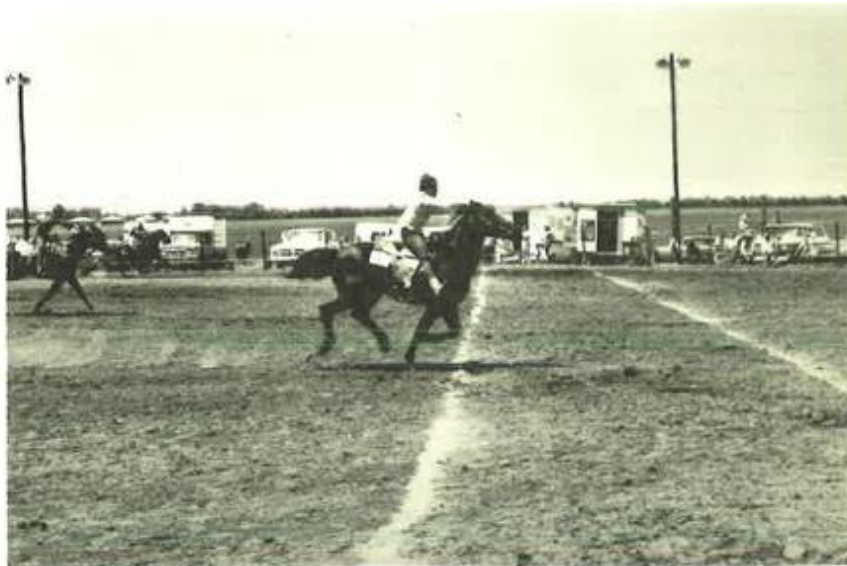
Across the finish line.